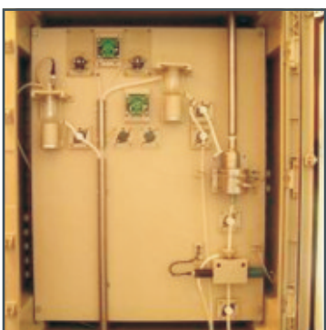
WAD 1000 Wet Box

On-line measurement offers fast and repeatable results. The analysis cycle time is of the order of 20 minutes per analysis.